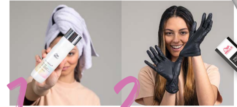
1 Shampoo and towel dry hair.