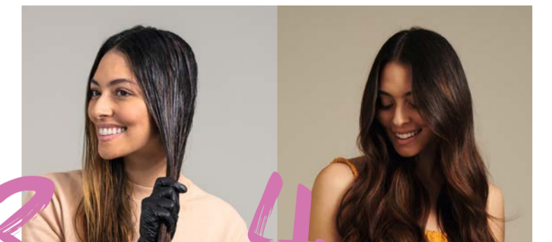
3 Apply generously, section by section- leave for up to 10 minutes.